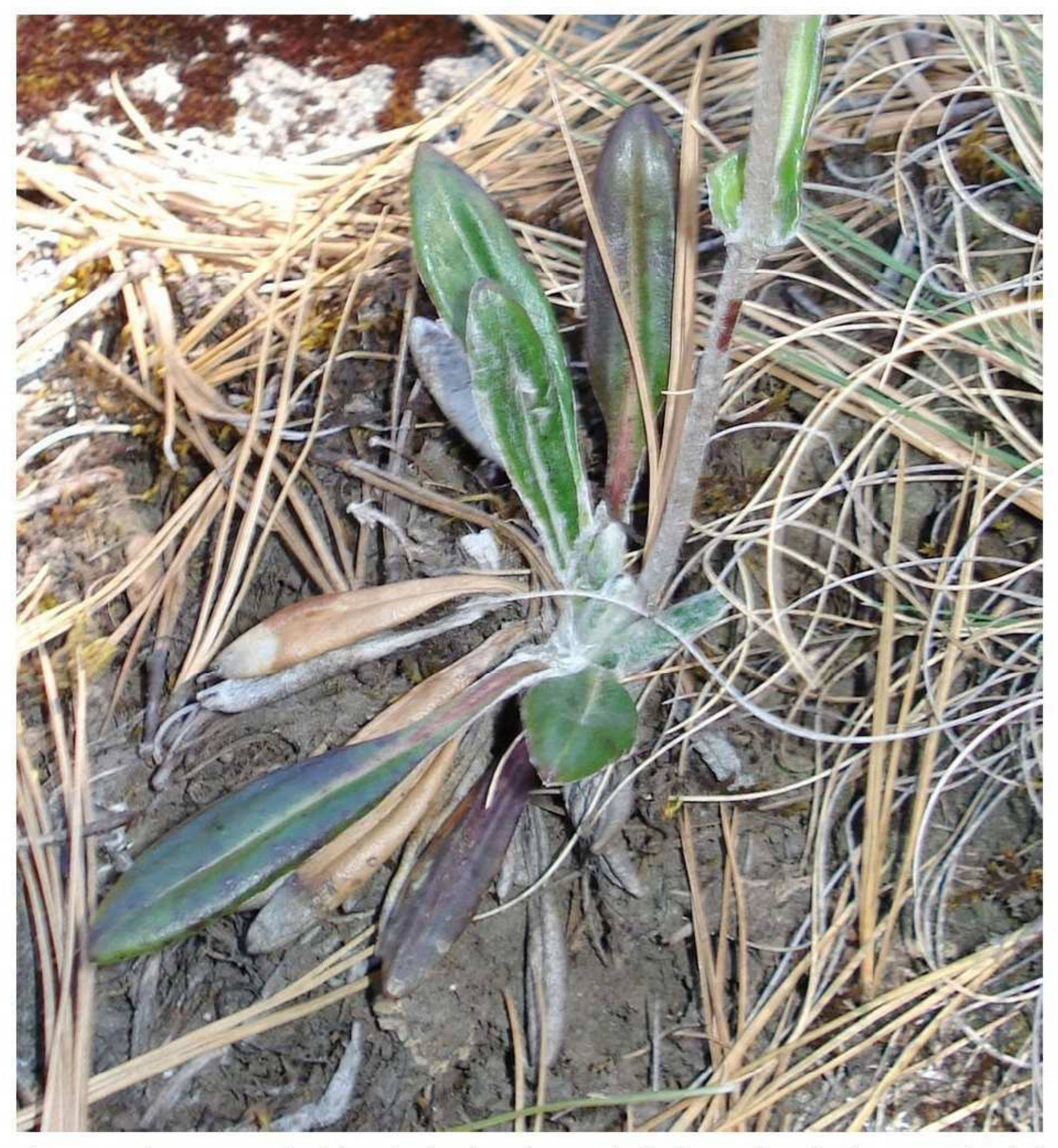
Figure 3. Robinsonecio gerberifolius, showing the subscapose habit, the prominent basal rosette, and radical leaves adaxially nitidous with impressed midribs. (Pruski & Ortiz 4163).

The purpose of the present account is to illustrate the microcharacters used to circumscribe Robinsonecio , to provide an expanded description of R. gerberifolius that may be inserted into Williams (1976), and to show that on the basis of microcharacters S. cuchumatanensis should not continue to be aligned with Robinsonecio . While both R. gerberifolius and S. cuchumatanensis are subscapose herbs occurring in the Sierra de los Cuchumatanes, with S. cuchumatanensis endemic to this range, the similarities between these two species are basically incidental.